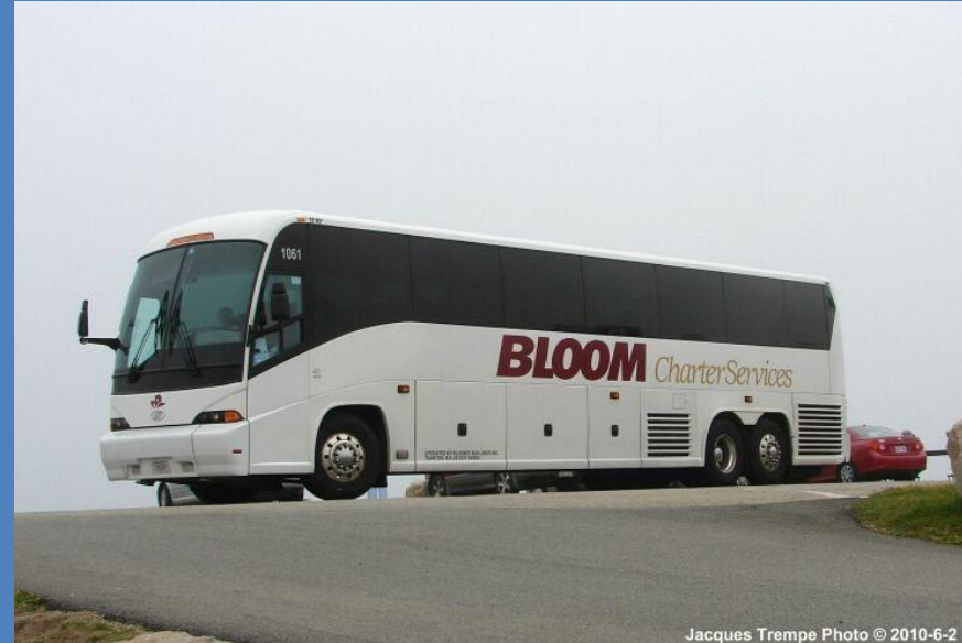
Jacques Trempe Photo © 2010-6-2